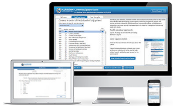
Online Interactive Career Portal